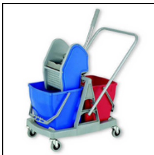
38LTR IMPORTED TROLLEY