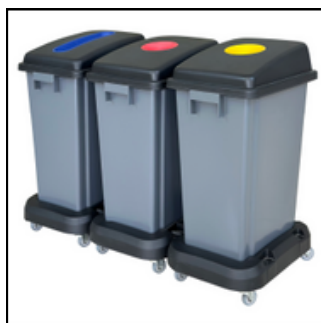
3-CLASSIFICATION BIN WITH WHEEL

Whether you're managing a hotel, hospital, mall, school, or commercial building, having the right tools ensures cleaning tasks are performed efficiently and consistently. Our range includes manual cleaning essentials such as microfiber cloths, mops, brooms, dustpans, and litter pickers — as well as larger equipment supports like janitorial carts, warning signs, and spray bottles.