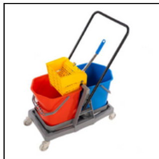
40LTR 2 BUCKET WRINGER TROLLEY