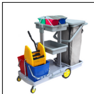
MULTIPURPOSE TROLLEY WITH WRINGER PREMIUM