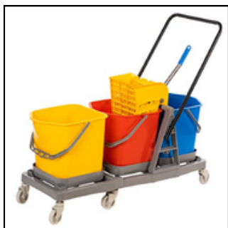
60LTR 3 BUCKET WRINGER TROLLEY