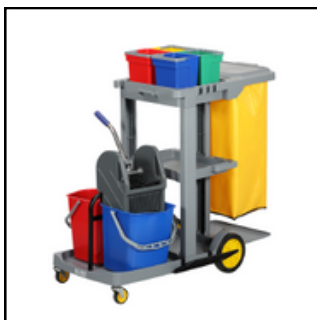
MULTIPURPOSE TROLLEY WITH WRINGER ECO