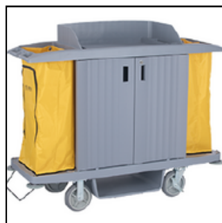
GUEST ROOM SERVICE CART (PLASTIC DOOR)